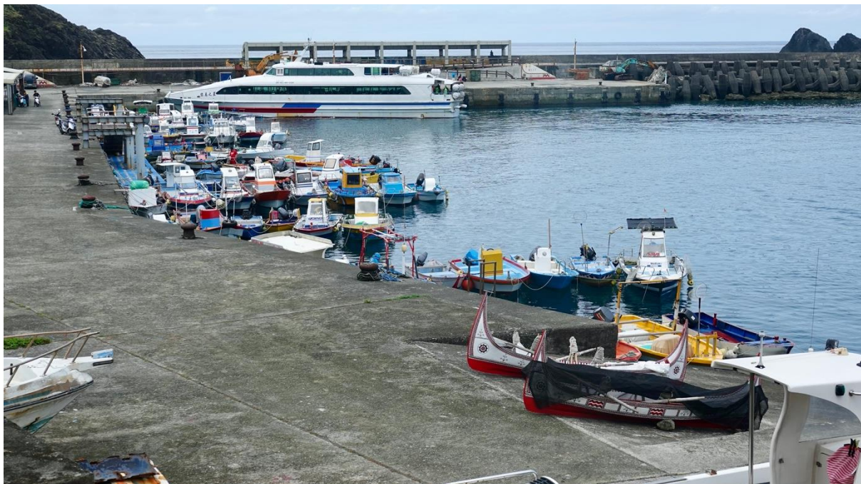
Figure Two: Modern and Traditional Tao Boats at Orchid Island's Harbour