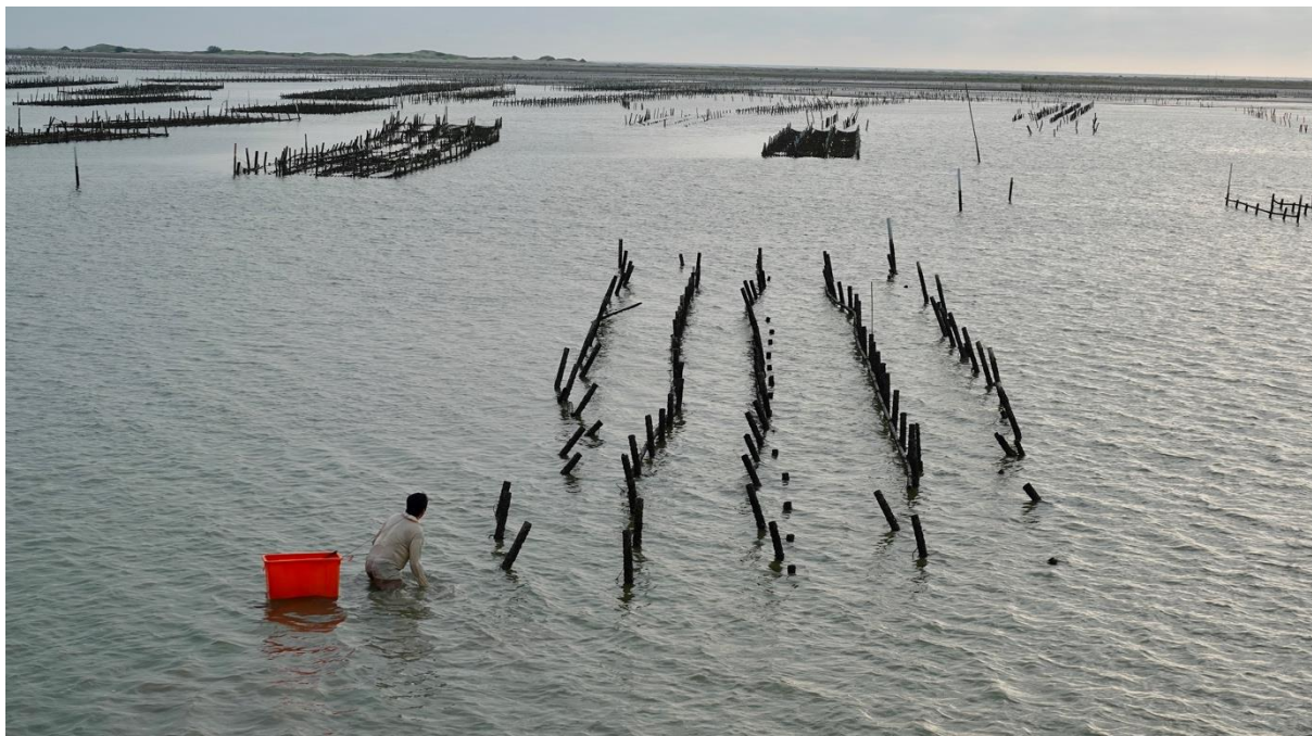
Figure 3: A man harvests oysters in the Taiwan Strait. These lives would be destroyed by conflict.

Second, the IPS gives priority to economic relations. This can be seen in the fact that the section on economic opportunities precedes the one on strategic challenges. Canada often refers to Taiwan as an economy, and it is on this basis that Canada and Taiwan engage as equals in international organizations (the WTO and APEC) where Taiwan is accepted as a full member. The IPS calls for strengthening science, technology and innovation partnerships with Taiwan and four other countries as part of supply chain resilience (Canada 2022b: 18). The exclusion of China from this list is noteworthy. The word “friendshoring,” brought into Canadian discourse by Deputy Prime Minister Chrystia Freeland (Freeland 2022), does not figure in the document, but the intention to consciously build supply chains through targeted economic interaction is signalled in a way that supports Taiwan. Economic relations are all about human livelihoods, whether those of engineers designing semiconductors or people raising clams in the Taiwan Strait (figure 3).