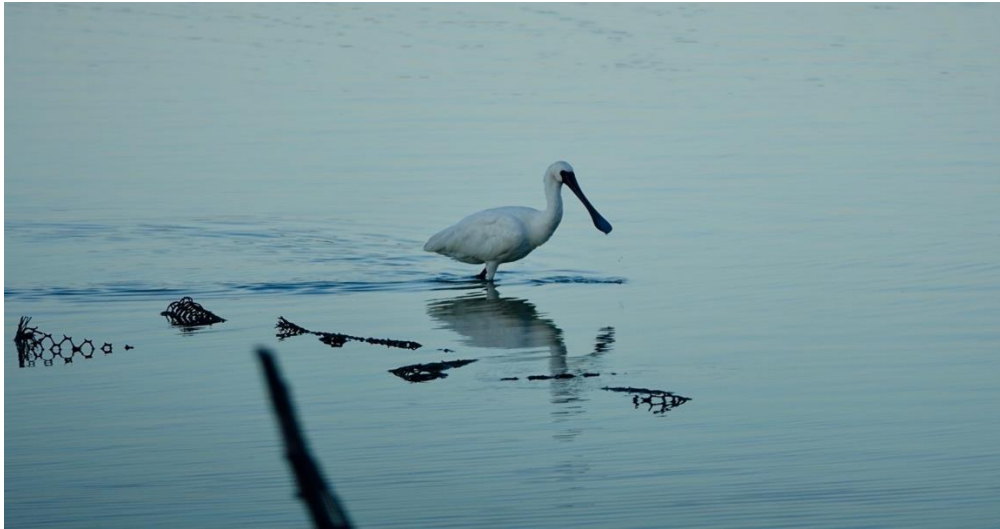
Figure 4: an endangered Black-faced Spoonbill in a wetland near the Taiwan Strait